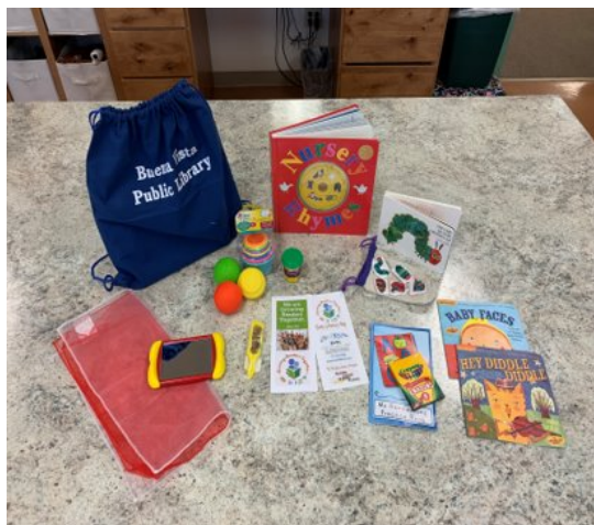
Literacy kits included a bag to store the materials, crayons, handwriting book, sorting cups of different colors and sizes, and a variety of books.

Librarians put a lot of thought into the preparation of early literacy bags or kits, and many assembled kits according to themes or adjusted for the child's age, either to be given away to FFNs or to be part of the permanent library collection. Librarians reported the flexibility of the grant was one of the parts they liked the most about GRT because it allowed them to decide whether to purchase, books, computers, or enhancing the environment based on the needs of their libraries. "We are the hot spot for little kids. We used the grant money to buy board books and leveled books. I ordered 2 shelves for the kids' room, the grant partly paid for them and our library covered the rest. It was great." (Northern Chaffee County- Buena Vista).