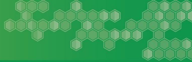
Chart of Accounts